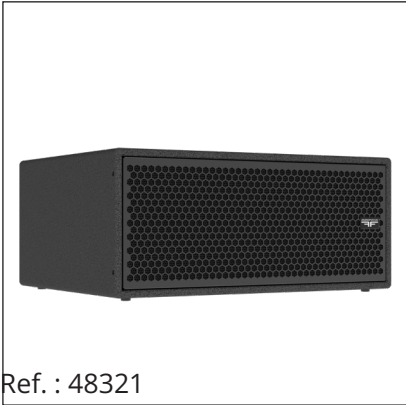
C210S 2x10" passive subwoofer