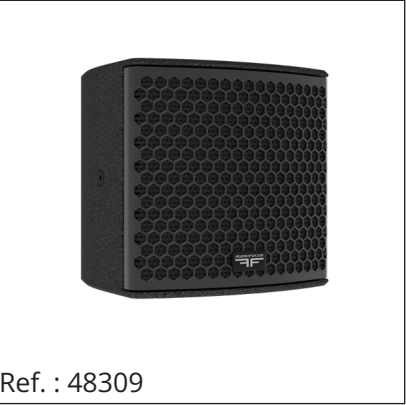
CYRIS CX6 Compact 6" coaxial