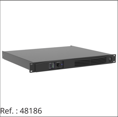
A-1504 SCIO 4 x 1500W amplifier with DSP