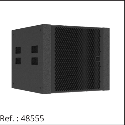
115SGa 1x15" self-powered subwoofer