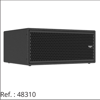
C210Sa 2x10" self-powered subwoofer