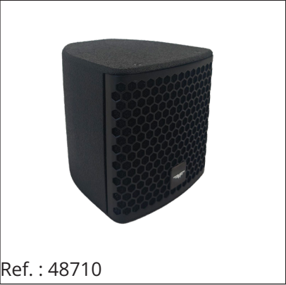
CYRIS CX5 Compact 5" coaxial