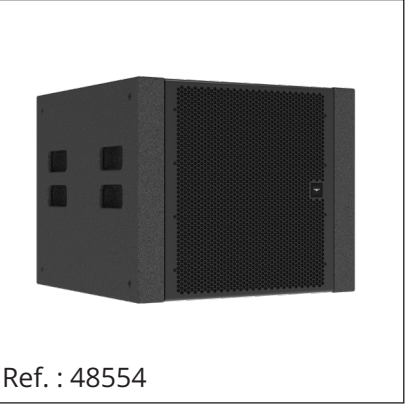
115SG 1x15" passive subwoofer